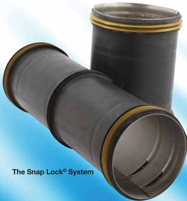
The Snap Lock ® System

Available in 2 Lengths 12" (300mm) & 24" (600mm)